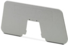
The figure shows the product version UHV-TP 1

Separating plate, length: 180.2 mm, width: 2 mm, height: 68.3 mm, color: gray